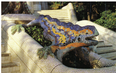
The pictures on page 2 and 3 are of works by Gaudí in Parc Güell, Barcelona