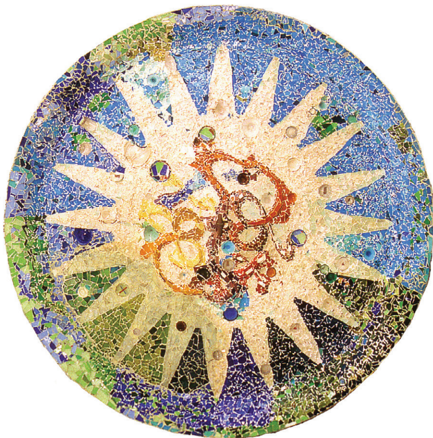
Mandala by Gaudi. Parc Güell, Barcelona

Postgraduate Programme in Supervision Organized by DSAP and the Jung Institute, Copenhagen